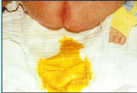
Poop can look watery.