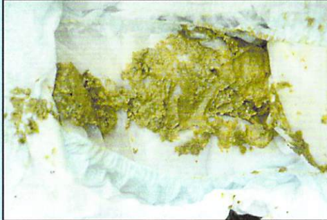
The poop turns green by Day 3 or 4.