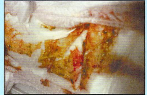
Illness, injury, or allergies can cause blood in poop. Call Doctor.