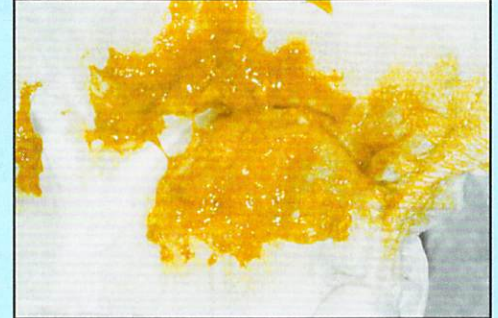
The poop should turn yellow by Day 4 or 5.