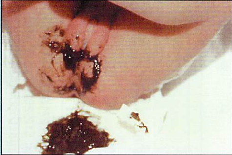
The baby's first poop is black and sticky.

The baby's poop should change color from black to yellow during the first 5 days after birth.